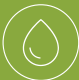
Oil & gas